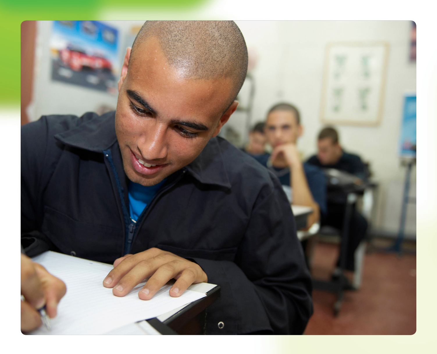
Part 2. How do people know about skills and qualifications?

With the global focus on climate change, knowing how to act sustainably has become an urgent factor